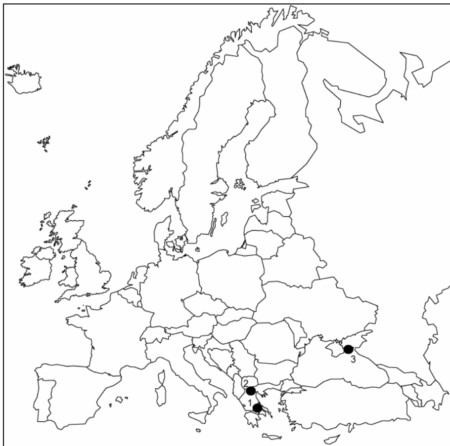
Fig. 1. Distribution of M. beotiae : 1 – Beozia, Greece – Durante Pasa & Maucci, 1975; 2 – Edessa, Greece – Durante Pasa & Maucci, 1975; 3 – Crimea, Ukraine – Kiosya & Inshina, 2007

Holotype and paratypes of M. beotiae were collected from moss sample on a rock in Beozia, Greece in 1975 and described in 1979 by M.V.Durante Pasa and W.Maucci (Durante Pasa, Maucci, 1979), who also collected eggs in Edessa (Greece). Since then tardigrades of this species haven't been recorded from any other localities till we have registered it in Crimea (fig. 1).