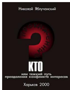
Who is a leper or a difficult way to overcome a conflict of interest?