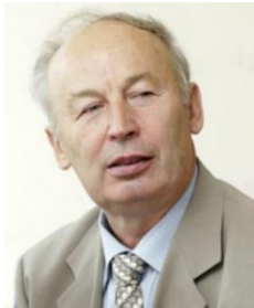
Minister of Health A.M. Serdyuk

telephone control during the period of Minister of Health A.M. Serdyuk, often more than twice a year, with a clear purpose, but each time the commissions ended in defeat.