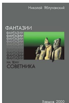
Fantasies on the theme of an adviser

After a ten-year break, I resumed the training of doctors of philosophy. Under my guidance, my students began to receive