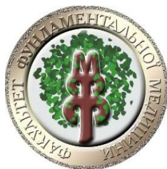
faculty coat of arms

The conditions for medical education at the Biological Faculty were not sufficiently favorable. The human factor was at play. The faculty saw medical students as a resource to increase their teaching load, so every hour devoted to medical education had to be fought for. There was an urgent need to separate and create a medical faculty, which I justified to the Rector. The Rector supported the idea. There were some obstacles, but we managed to overcome them.