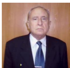
Academician A.D. Vizir